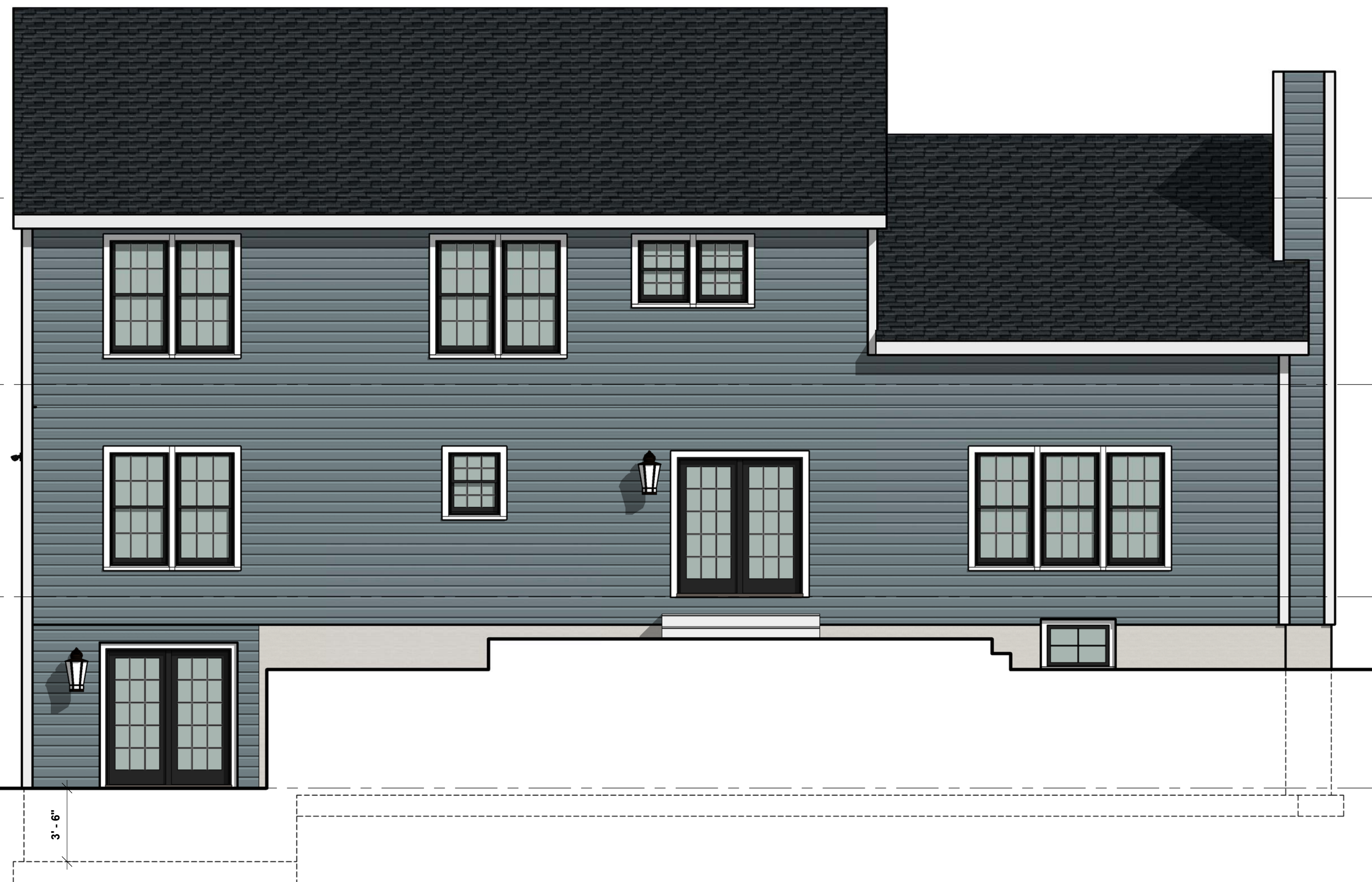
4 BACK ELEVATION 1/4" = 1'-0"