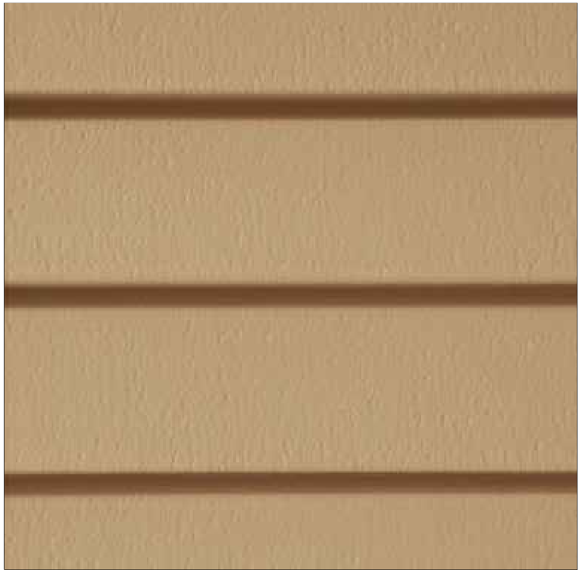
SIDING/ CORNER BOARDS: CERTAINTEED 4" EXPOSURE HORIZONTAL VINYL SIDING COLOR: BUCKSKIN