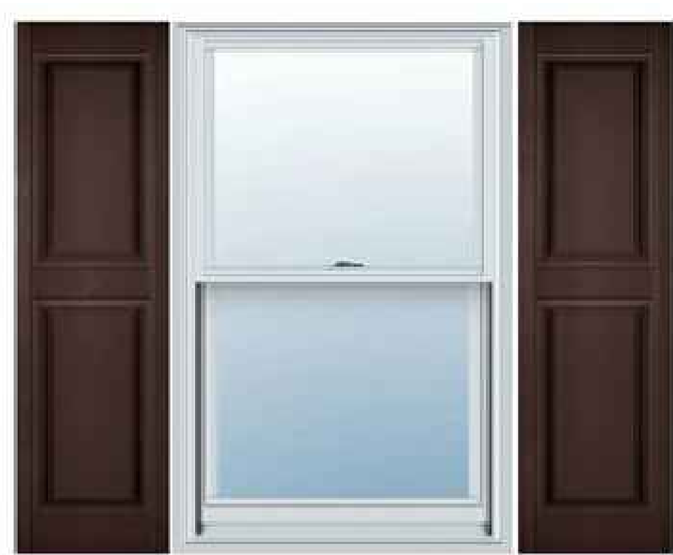
SHUTTERS: RAISED PANEL VINYL SHUTTERS COLOR: BROWN