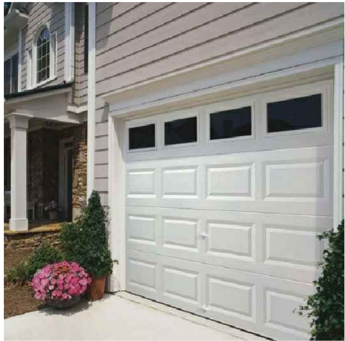
GARAGE DOORS: COLONIAL HORIZONTAL SQUARE PATTERN WITH GLASS TOP OF DOOR, STEEL MATERIAL CONTENT COLOR: WHITE