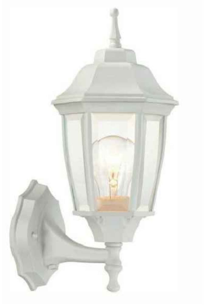
EXTERIOR LIGHT: EXTERIOR LIGHT MODEL 78421-WH COLOR: WHITE LOCATIONS: FRONT DOOR REAR SLIDING GLASS DOOR GARAGE DOORS