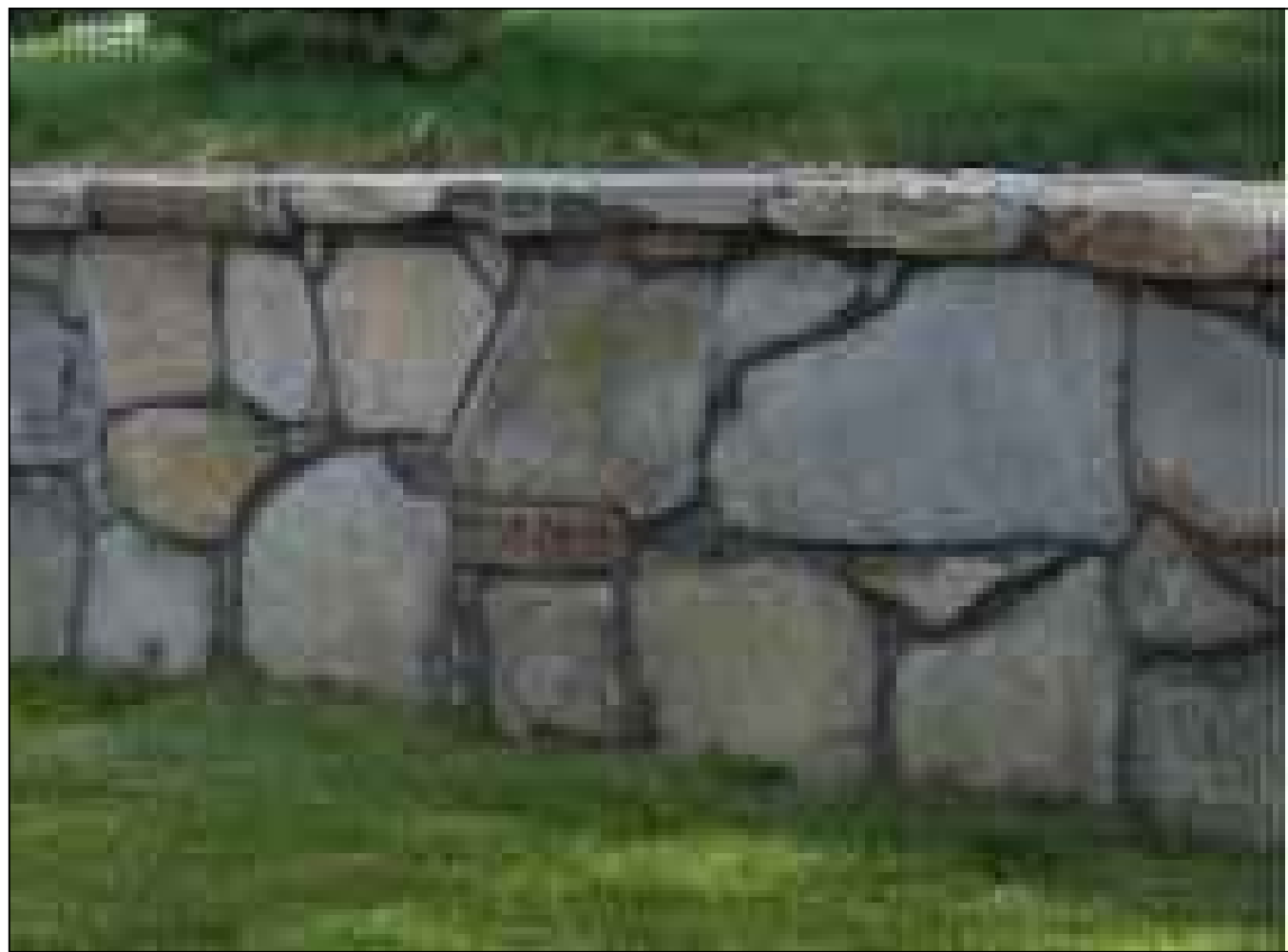
RETAINING WALL STONE