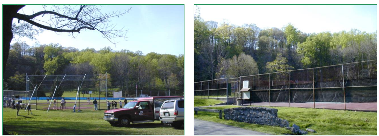
The baseball field, tennis courts and play equipment are located within a beautiful setting at Ryder Park.

The Town and Village Parks Departments and the Recreation Department should ensure that the parks, preserves and public areas are clean, comfortable and safe amenities for the community.