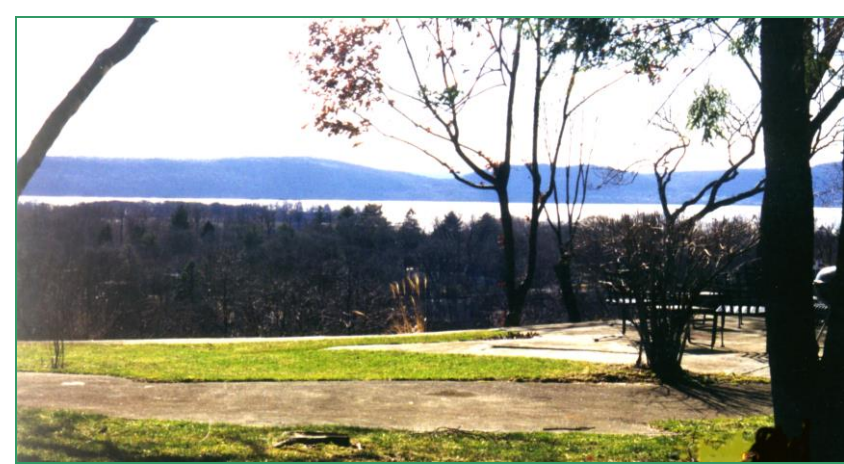
View of the Hudson River from a Crotonville property.

4. <u> Objective </u>: Continue on-going maintenance of the park and recreational facilities in order to provide clean, efficient services and programs to the community.