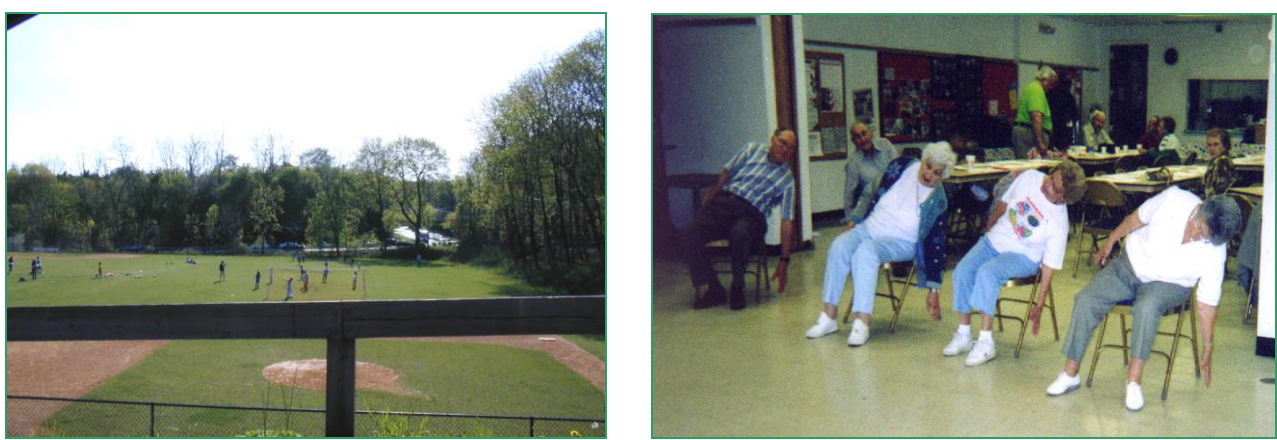
Outdoor and indoor recreation and exercise activities are available for all ages.