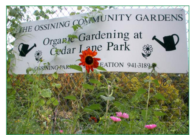
The Ossining Community Gardens at Cedar Lane Park.

Town of Ossining Comprehensive Plan Update