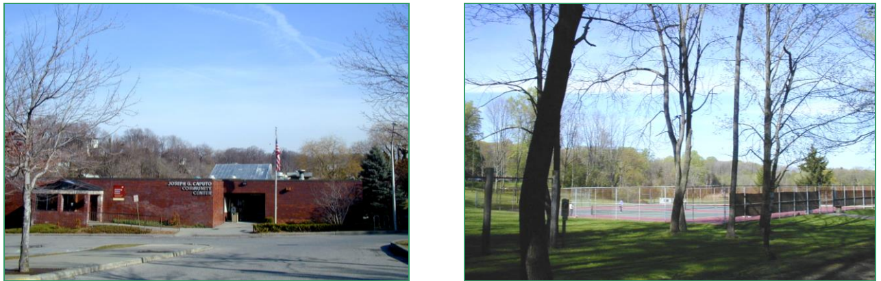
The Community Center (left) and parks (Ryder Park on right) offer a variety of recreational activities, including basketball and tennis courts, playgrounds, ballfields, fishing, picnic areas and senior programs.

The Town and Village Parks Departments and the Recreation Department should coordinate efforts with the public library, schools, Green Ossining and other organizations and prepare an inventory of recreational and cultural programs, activities, services and facilities available from each agency/group. The inventory and interaction amongst these groups could also identify service gaps, duplication of programs/activities, under-utilized facilities, and possible cost-sharing opportunities.