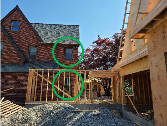
One story hallway from driveway view

Requesting to add 2 nd floor onto hallway from main house to garage/recreation room structure