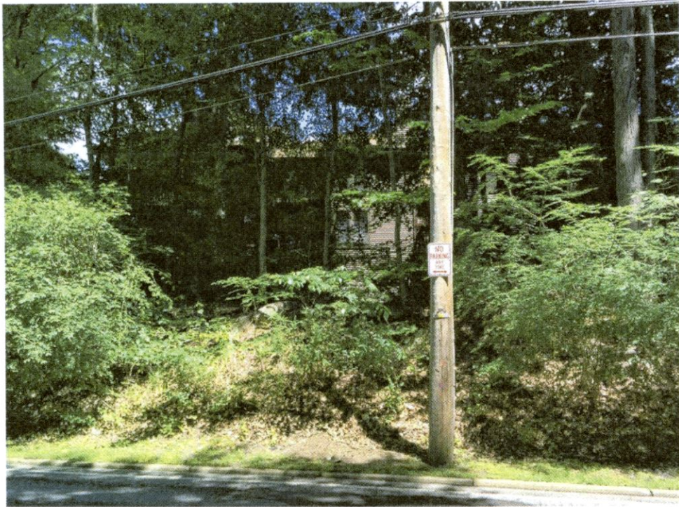
7. The Woods, Hawkes Avenue