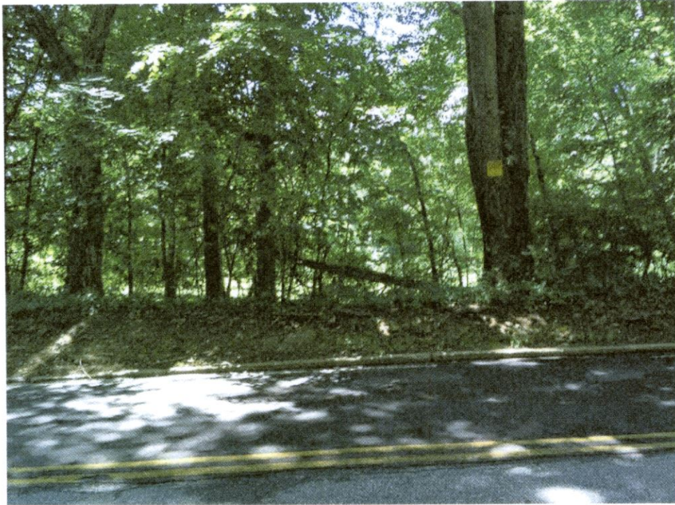
5. Parth Knolls, Proposed Entrance, Hawkes Avenue