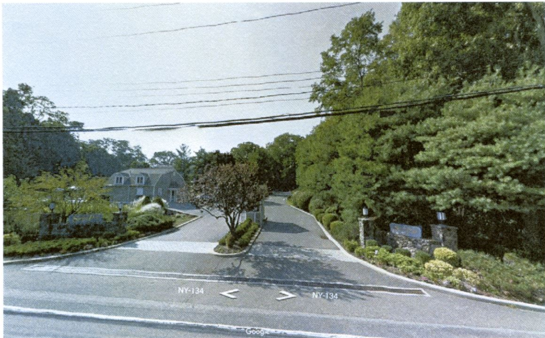
9. Spring Pond, Route 134