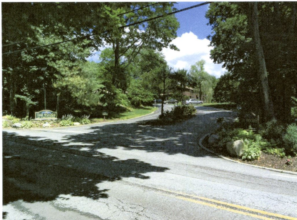
4. The Woods, Hawkes Avenue