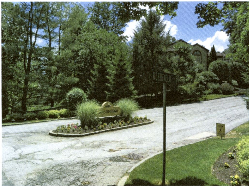
8. Deerfield, Hawkes Avenue