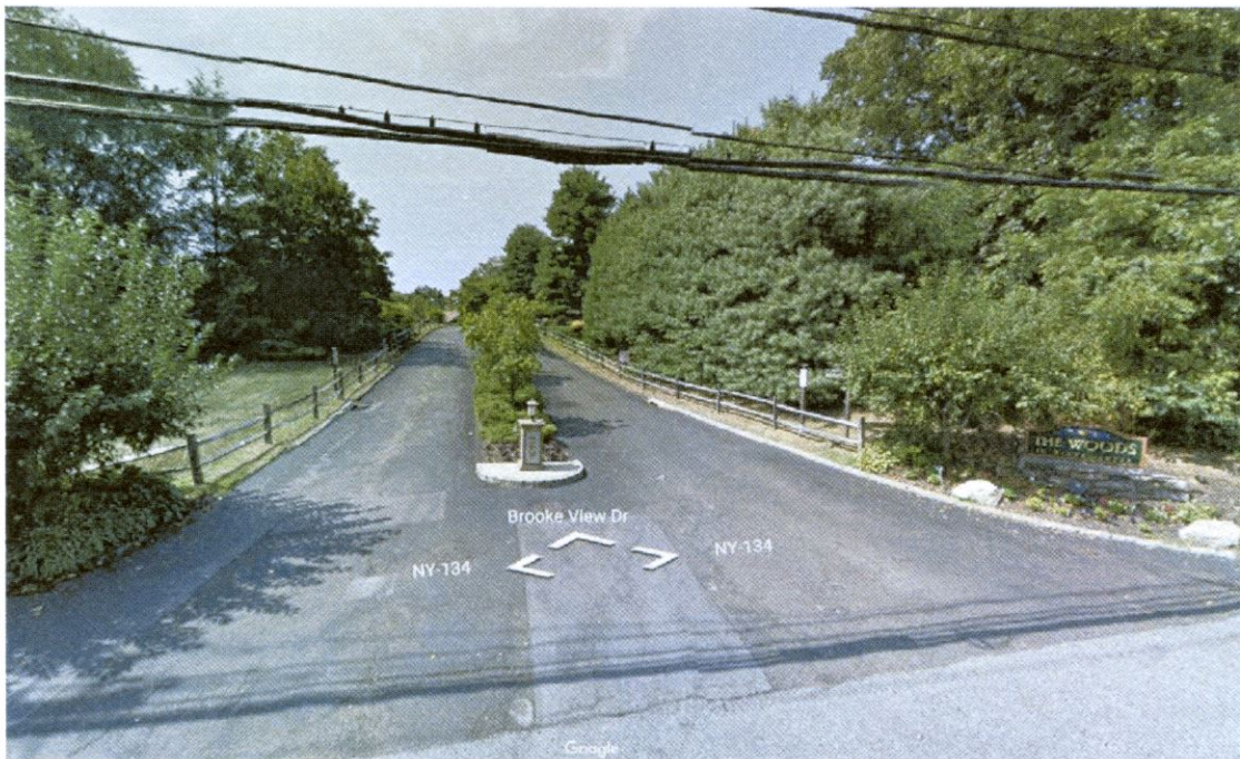
10. The Woods, Route 134