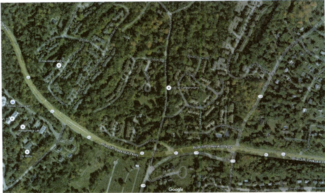
1. Aerial View