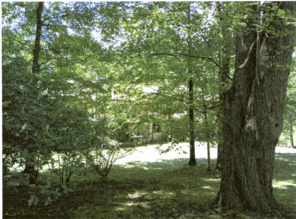
6. Deerfield, Hawkes Avenue