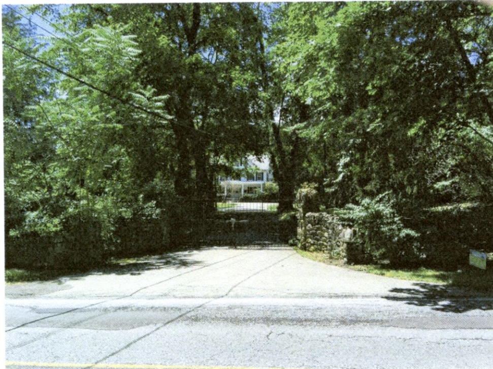
3. Parth Knolls, Existing Site Entrance, Hawkes Avenue