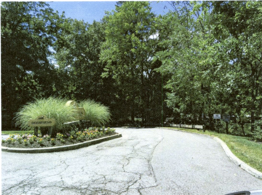
2. Deerfield, Hawkes Avenue