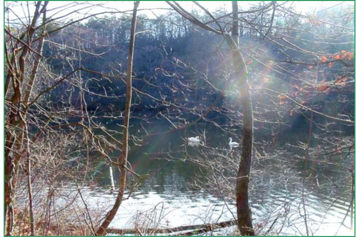
Water resources in the Town consist of various streams, ponds, lakes, aquifers, the river and reservoir.