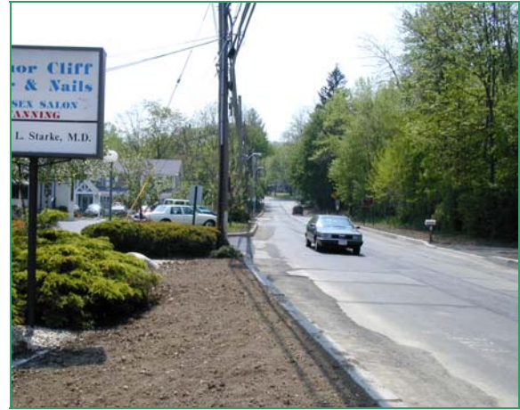
Trees, landscaping and well maintained roadways contribute to a positive visual image of a community while preserving natural resources. (Left: Garden City, NY; Right: North State Road, Ossining)

5. Objective: Establish an integrated open space and trail network connecting parks, preserves, open spaces, institutional properties, schools and other community resources which will provide important aesthetic and environmental functions as well as opportunities for the community to more fully enjoy the resources.