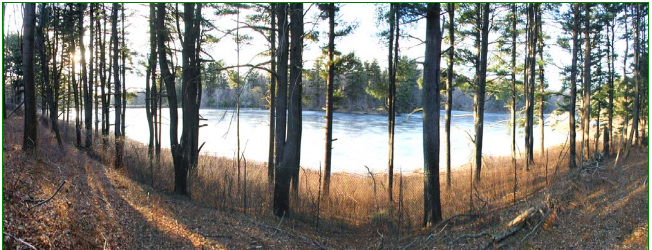
View of the Indian Brook Reservoir during the winter-time.