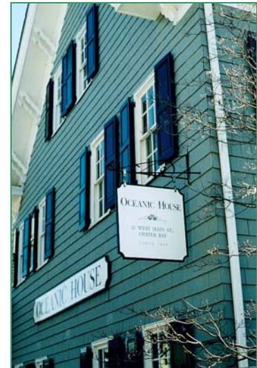
Design guidelines identify appropriate façade treatments, signage, lighting and other attributes which contribute to a community's appearance. (Left: Bronxville, NY; Right: Oyster Bay Hamlet, NY)