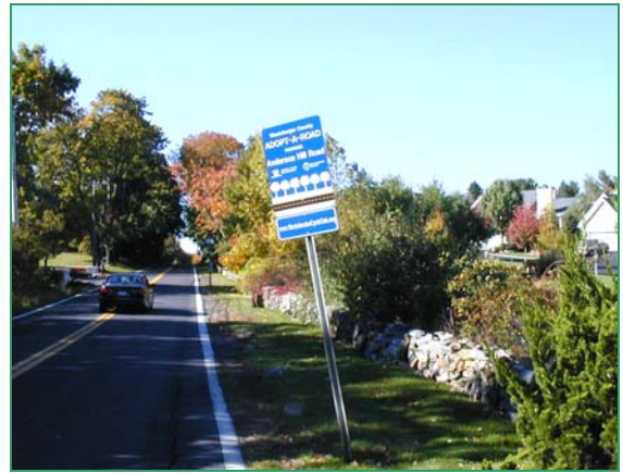
Adopt-a-Spot and Adopt-a-Road Programs are used by many communities as a way to get residents, businesses and civic groups involved in helping to plant open space areas and islands with attractive landscaping and keep them well maintained. Acknowledgement of the dedications and sponsors can be done with appropriately scaled plaques or markers. (Left: West Roxbury, MA; Right: Rye Brook, NY)