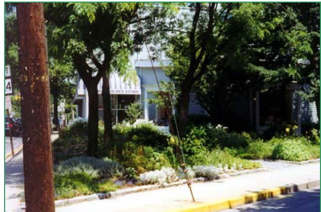
Landscaping and beautification efforts on public and private properties contribute to a community's image.