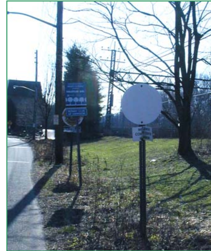
Multiple signs along roadways and commercial sites should be consolidated to improve the overall visual appearance.